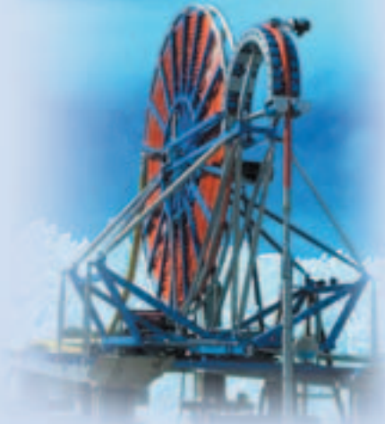
Ice Drilling Arctic.