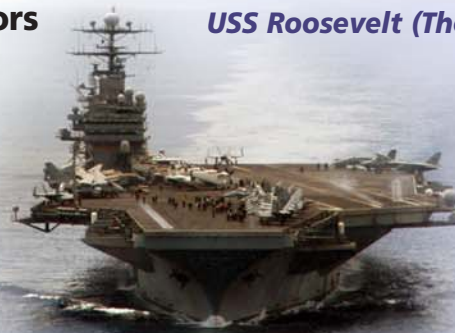
USS Roosevelt (The Big Stick)