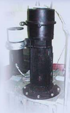
US Navy Warping Winch Drive