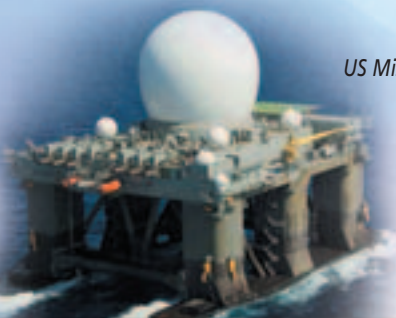
US Missile Defense Antenna