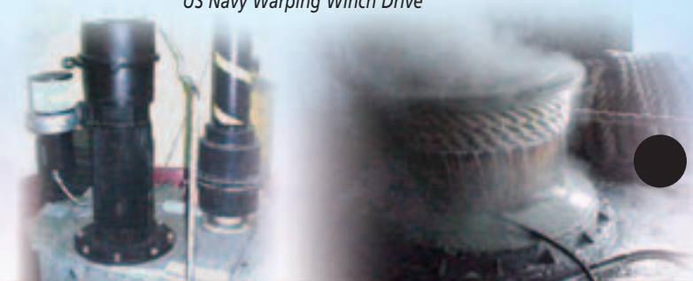
US Navy Warping Winch Drive