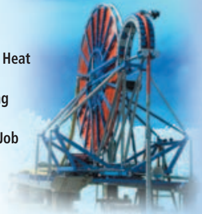
Ice Drilling Arctic.