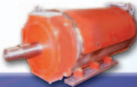
Steel Frame NVH Testing Low Vibration Motor